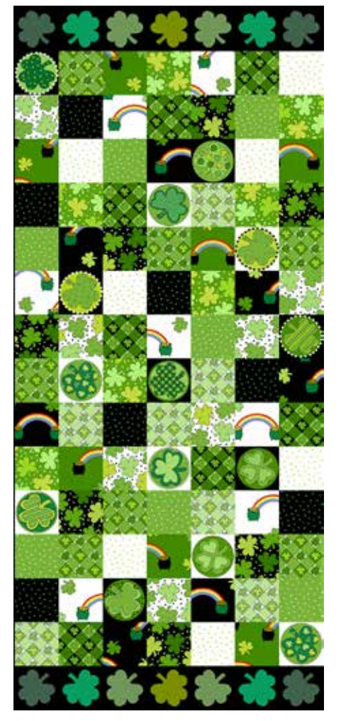
Table Runner Diagram

4. Layer the runner with batting and backing and baste. Quilt in the ditch around patches. Quilt around the shamrocks and printed motifs. Bind to finish the runner.